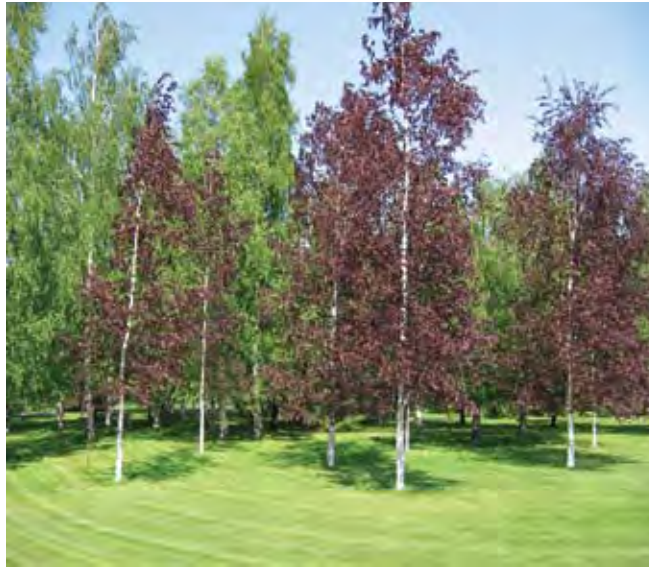
The only specimen of red-leaved downy birch ( Betula pubescens f. rubra ) in nature was found in the early 1970's in northern Finland. A micropropagation method for the tree was developed at the University of Oulu Biology department.

When listing the hardy plants, results from previous similar research and plant selection projects, and the plant collections and databases of the participating institutes were valuable sources. Most of the plants mentioned in the list are native to Finland. These wild plants are especially suitable for the restoration of damaged areas. Several ornamentals, introduced and native, as well as new potential species are also included. All plants mentioned in the book can not be found in the nurseries yet, but many of them are for sale. For instance germander spiraea ( Spiraea chamaedryfolia ), knotgrass ( Aconogonon divaricatum ) and avens ( Geum 'Borisii' ) are commonly used ornamental plants. Shrubby cinquefoil ( Dasiphora fruticosa ) 'Tervola' and cowslip ( Primula veris ssp. macrocalyx ) are examples of plants taken to cultivation from plantings in northern Finland. Interesting plants for nursery business are also growing in the Botanical