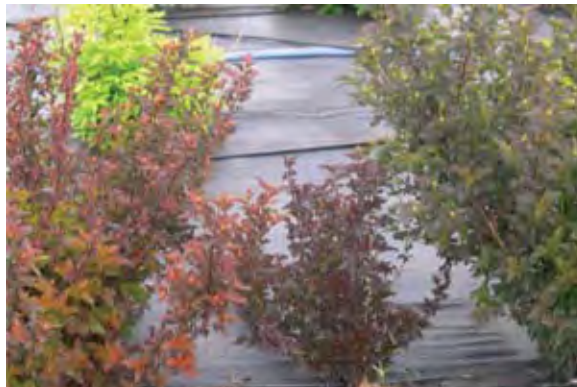
This ninebark seedling (center) is considerably smaller than surrounding plants.