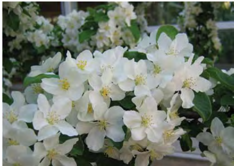
A very good Siberian crab apple ( Malus baccata ) growing in the Oulu Botanical Gardens. It was grown from seeds collected in South Korea by the Nordic Arboretum Committee in 1976. There are several trees from this seed lot but this individual is the most beautiful with big flowers around the branches. The tree has been hardy e.g. standing over the cold winters in the 1980's.

The listed hardy plants and examples of their use in different habitats are presented in the guidebook written about hardy plants of northern tourist destinations. It gives a general overview about northern nature, and describes the possibilities of sustainable landscaping and restoration. Plant propagation methods and the established demonstration areas are also presented. The guidebook written in Finnish, with an English summary, figure legends and table texts, contains a total of 96 pages. Though aimed for the public in northern and especially in northern tourism areas, the guidebook has gained interest among landscape planners and educational institutes throughout Finland. The electronic version of the guidebook, further information and other publications of the LANDSCAPE LAB project and LABPLANT subproject can be found in the Internet: http://www.arcticcentre.org/landscapelab