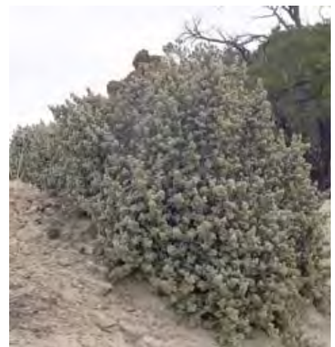
Shepherdia rotundifolia growing in its native habitat.