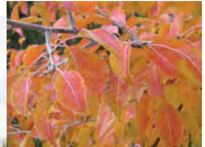
Fall color of Silver Ball pear. Silver Ball is late to develop fall color and, as a result, does not always color well.