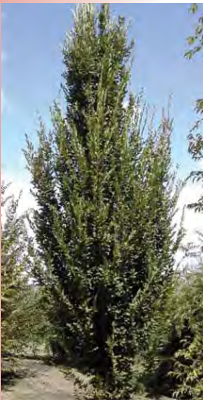
Columnar Carpinus selection