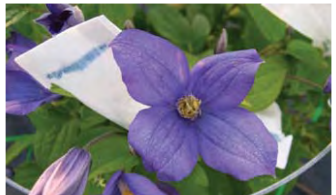
This promising Clematis selection is a hybrid between C. integrifolia and a large flowered vine forming cultivar.

We have made good progress in developing non-vining cultivars of Clematis . Hybrids between Clematis integrifolia and C. hexapetala are very promising. Flowers are blue in color and upright facing. We also have many hybrids between C. integrifolia and C. recta . These have smaller flowers and are also upfacing. In addition we have some hybrids between