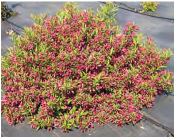
Low growing Weigela selection