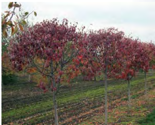
Promising sterile selection of pear in fall color