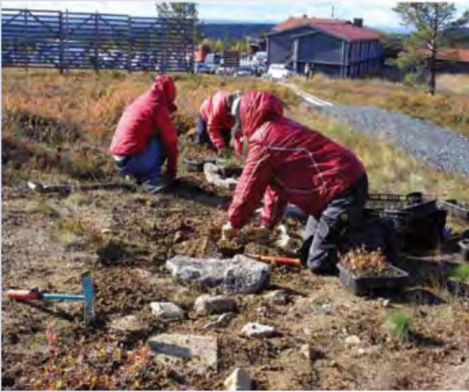
Students from the Lapland Vocational College planting e.g. bog bilberry ( Vaccinium uliginosum ) in a demonstration area located in Pallas-Yllästunturi National Park near the hotel and parking area. With the plantings the old eroded trail is merged into the surrounding vegetation. The new hiking trail is seen on the right.

During the subproject over 300 hardy plants were listed and over 100 species were propagated from seeds or cuttings or in vitro by micropropagation. Micropropagation was used for several plant species, since it also offered the possibility to propagate plants during the long winter months. It is an efficient method to produce large amounts of plant material in a limited time schedule, such as in the LABPLANT subproject. Micropropagation was also the preferable method for the species from which a limited amount of propagation material was available. The plants propagated were planted both in the demonstration areas and into the collections of the Botanical Gardens and Lapland Vocational College.