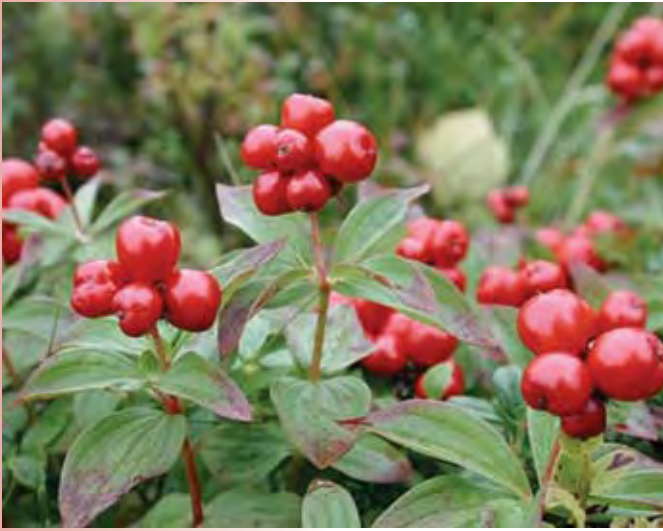
Eurasian dwarf cornel ( Cornus suecica ) is showy in the autumn. The American species C. canadensis seems to be easier to propagate.