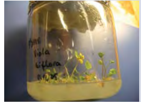
In vitro propagated seedlings of yellow wood violet ( Viola biflora ).

In autumn 2004 a European Union LIFE Environment project “Tourist Destinations as Landscape Laboratories - Tools for Sustainable Tourism (LANDSCAPE LAB)” was launched. The project was coordinated by the Arctic Centre of the University of Lapland, Finland. Several partners were involved in four parallel subprojects of the project that ended in October 2007. The project produced new knowledge on the environment-related attitudes and land use, and developed and presented methods that tourism operators can use to estimate and promote the sustainability of tourism.