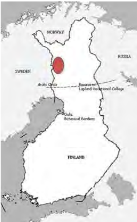
Map showing the location of the University of Oulu, Botanical Gardens and Lapland Vocational College in Finland. The implementation area of the LANDSCAPE LAB project is marked in red. The demonstration areas established in the LABPLANT subproject are located inside this area.

2 Thule Institute, University of Oulu, Finland