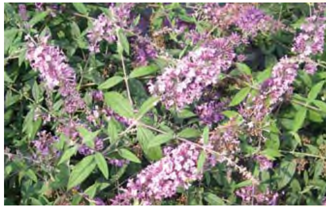
This Buddleia selection has survived for the last 2 years in 2 different locations in Minnesota as a dieback plant.

provided funding for a graduate student to work on the project. The project goal is to develop new landscape plants by use of various biotechnology approaches including in vitro mutation breeding, ploidy manipulation, and genetic transformation. Plant characteristics sought include compact plant habit, sterile cultivars of invasive species, plants with colored foliage, etc.