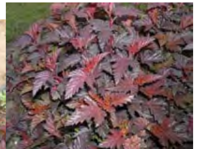
Promising compact selection of Physocarpus opulifolius