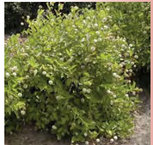
Compact buttonbush selection