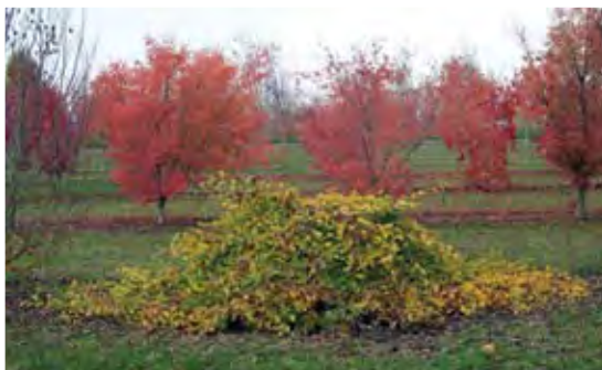
Weeping selection of Carpinus in foreground and maple hybrids in background in fall color.

field where we will evaluate the dwarfing potential of the selections that were used as the interstem.