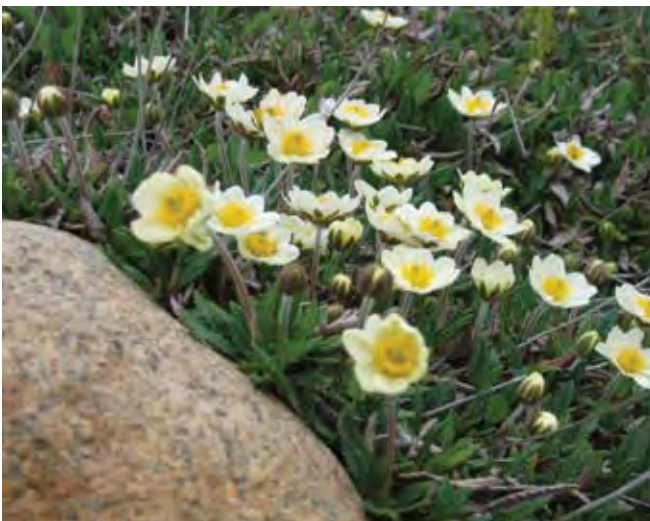
Mountain avens ( Dryas octopetala ) grows very well also in a rock garden.

Several deciduous trees are hardy in the north. Handsome, on dry soil growing silver birch ( Betula pendula ) with pendulous branches is the most popular street tree in northern Finland. Downy birch ( B. pubescens ) is more common in the north, it grows also on peatlands. Some forms and varieties of these native species, like rare red-leaved downy birch ( B. pubescens f. rubra ) and curly birch ( B. pendula var. carelica ), are important ornamental trees in the north. Native European mountain ash ( Sorbus aucuparia ) is a versatile woody plant that can be grown as a large shrub or a single-stemmed tree. It is beautiful in different seasons, abundant white flowering occurs in June, red berries that attract birds ripen in August-September, and the leaves have beautiful red autumn coloration. Introduced Asian mountain ashes S. sambucifolia and S. tianschanica are grown in the Botanical Gardens. They likely