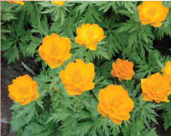
Asian globeflower ( Trollius asiaticus ) flowers in late May and early June. It hybridizes easily with the native European species, which need to be taken into account when planting the species in the areas where T. europaeus grows wild.

have potential as cultivated trees also in more northern areas of Finland. The big flowered S. tianschanica can be seen grown as a street tree even in the Kola Peninsula, Russia. Sorbus and Prunus species belong to the few ornamental trees with a flourish blooming in the north. Besides native bird cherry ( P. padus ) also Manchurian cherry ( P. maackii ) and pin cherry ( P. pensylvanica ) are hardy.