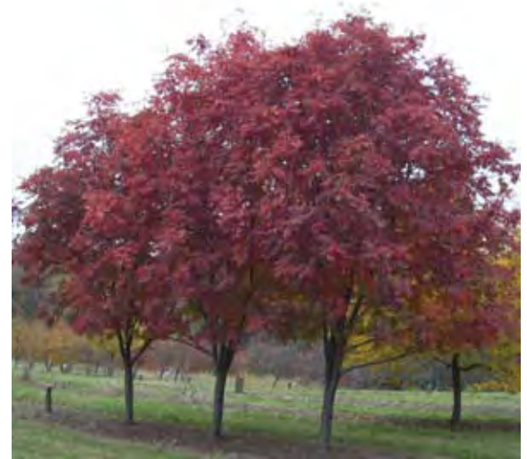
Promising Sorbus selection in fall color (above). Compact selection (below) has Sorbus X Aronia background.

We are continuing our efforts to develop superior Mountain Ash that are more tolerant of environmental stresses and have greater resistance to fireblight. Several selections were planted at our new research station in Minnesota in 2006. We propagated three selections in 2008 for evaluation in different geographic regions. Two very compact plant selections and one with more typical growth habit look quite promising.