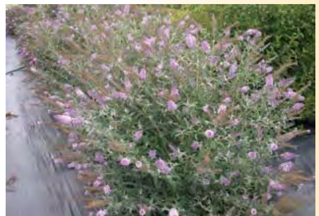
Promising Buddleia selection with silvery foliage and lavender flowers.