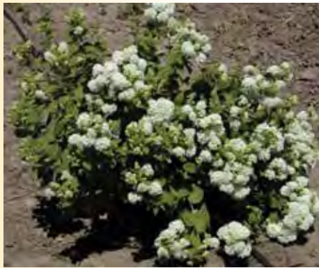
Selections of New Jersey Tea ( Ceanothus americanus ). The plant in the upper photo flowers earlier than other selections.

P. opulifolius selections with dark foliage color. We hope to gain the smaller plant habit of P. monogyna with a dark foliage color.