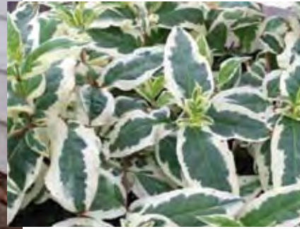
Cool Splash™ Diervilla